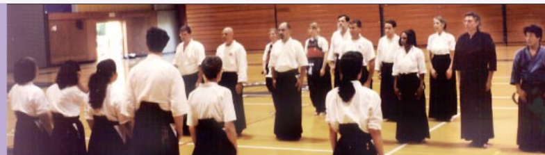
Promotional Test 1999