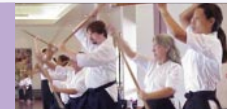
Seminar, Basic Training