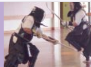
Practice in bogu