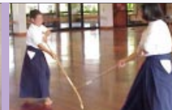
Collin Chiu (NCNF) with Tanaka Sensei (NCNF)