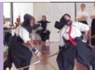
Men's Individuals Matches