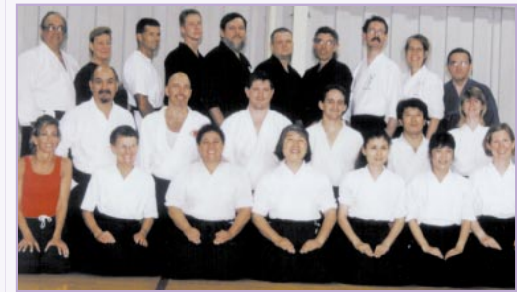
Long Island Seminar Participants, August 1999